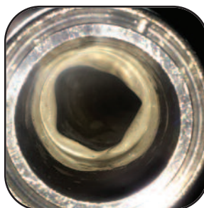
In-service competitor's hose assembly

With our extensive knowledge learned from the pharmaceutical industry, our hose assembly crimp technology offers smooth hose-to-fitting transitions, eliminating voids where beer spoiling bacteria can lurk and grow.